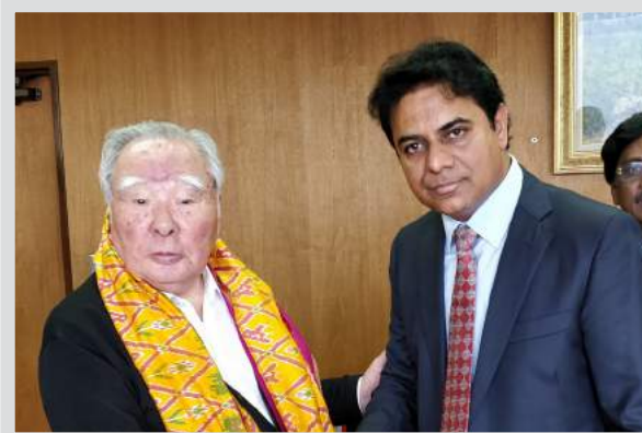
IT Minister KTR with Suzuki Motor Corporation Chairman Osamu Suzuki, during Japan Tour