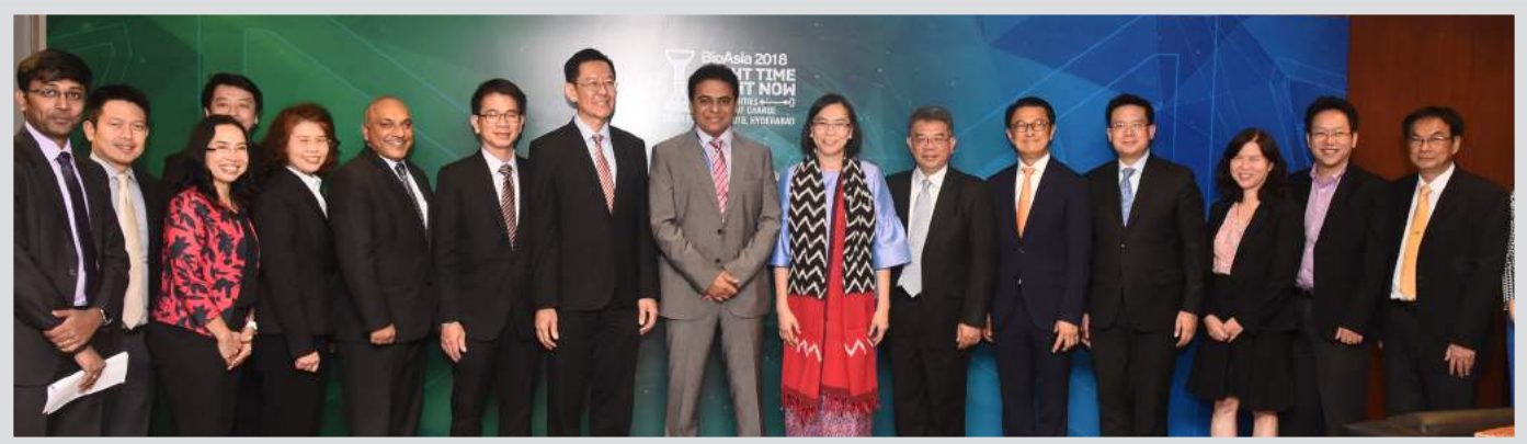
A business delegation led by Ms Chutima Bunyapraphasara, Hon'ble Deputy Commerce Minister, Thailand, met IT Minister KT Rama Rao on the sidelines of Bio Asia 2018 in Hyderabad.